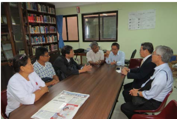
Meeting with officials at Kirtipur Teaching Hospital

It was decided that HeW CO-OP JAPAN and APHCO would continue to disseminate information and to call for support for Nepal.