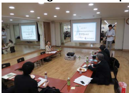
Learning about SEOUL Health Welfare Social Coop

On October 13, 2015 (Tue.), 10 people who attended the 10 th APHCO General Meeting (including 3 secretariats) visited an oriental medicine clinic and a dental clinic run by SEOUL Health Welfare Social Cooperative.