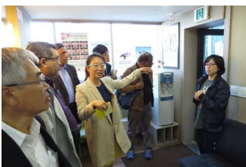
Visit to a dental clinic